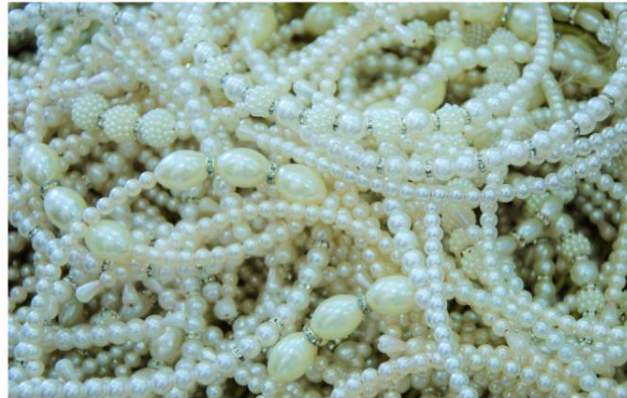
Don't be fooled by faux pearls