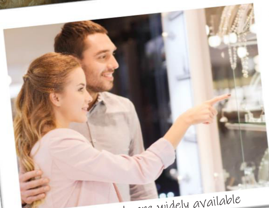
Today, pearls are widely available