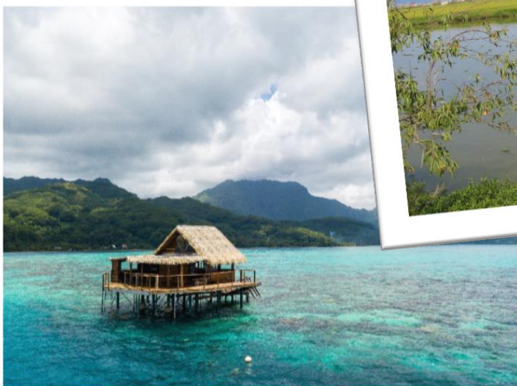
Saltwater Pearl Farm