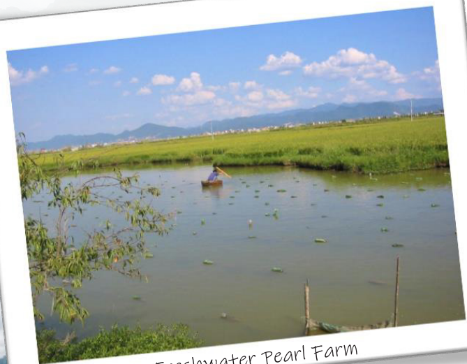
Freshwater Pearl Farm