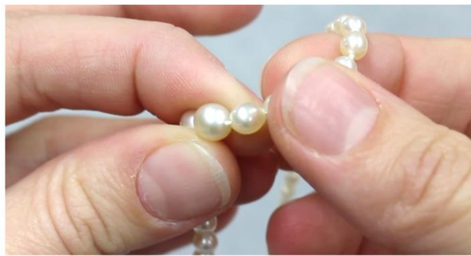
Small drill holes on natural pearls