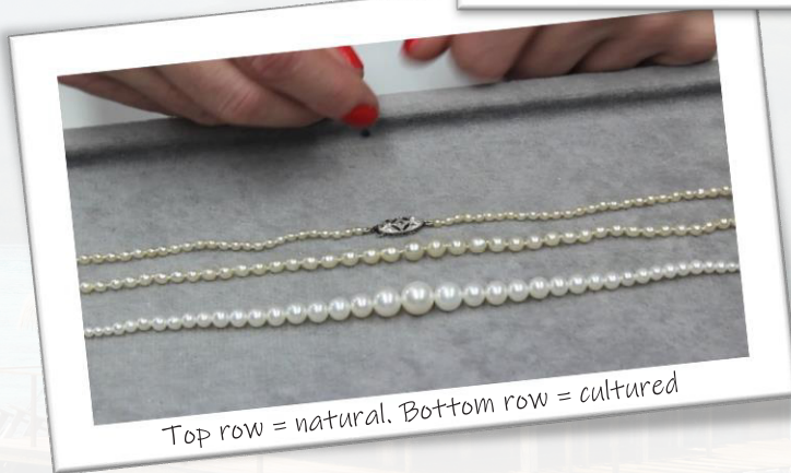
Top row = natural. Bottom row = cultured

Also, you may want to look at the shape. With culturing getting better and better, and people like myself going out to sort the wheat from the chaff, some often expect pearls to be blemish free and round but often natural pearls have a more 'raw' look, more off shape, perhaps not a perfect match on the stand, and often smaller in size. They are highly likely to also be graduated.