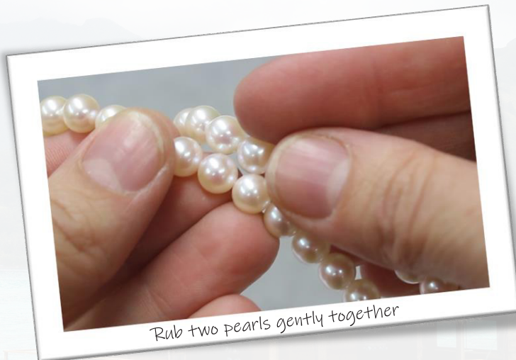
Rub two pearls gently together

misleading... a pearl may either be natural or cultured.