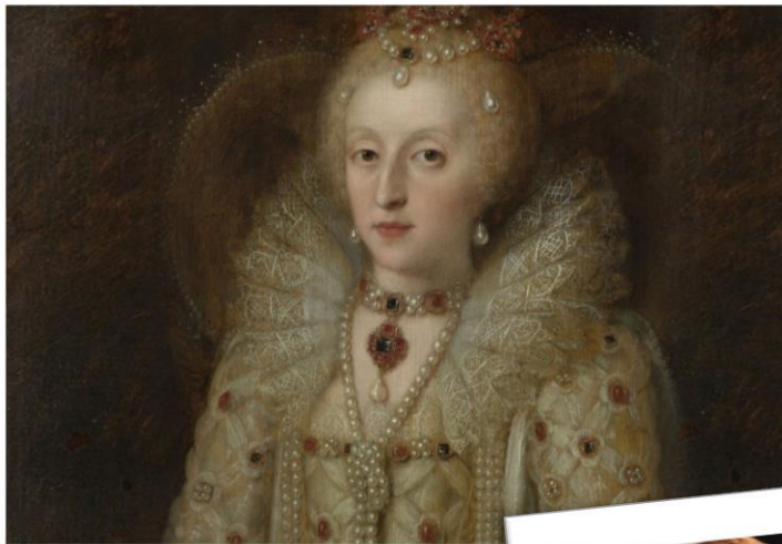
Pearls were once unobtainable by most

only the very rich, and royalty that could gain access to them.